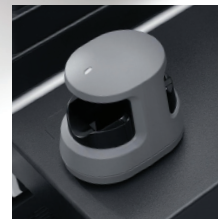
Biometric Authentication, HID Proximity Cards, and other powerful options guard your bizhub from unauthorized use.

HDD Lock applies password protection to your bizhub 250 GB hard disk drive. The Job Erase function automatically overwrites your HDD up to three times every time a job is performed. When you move your bizhub device to another location, HDD Sanitizing can overwrite data in eight different modes so sensitive information will not be compromised. These comprehensive overwrite methods meet United States DoD, NSA and other international standards.