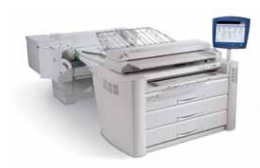
6622 with Folder

Our guarantee is the leader in the industry. The Xerox Total Satisfaction Guarantee applies to equipment under a Xerox warranty or Xerox maintenance agreement, subject to certain restrictions.