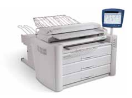
6622 with High Capacity Stacker