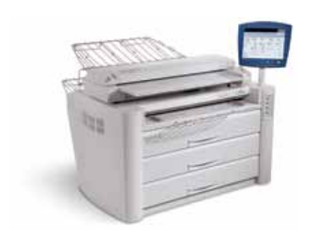
6622 with Output Tray