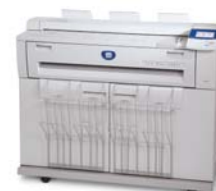
Digital Copier/Printer with Scan-to-File/Net