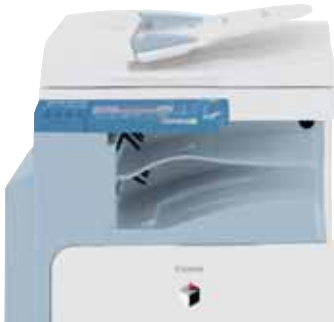
Inner two-way tray

A high print resolution of up to 1,200 x 1,200dpi (maximised) ensures that documents are produced with complete clarity and fidelity. This is ideal for when you're printing documents that require crisp images and accurate diagrams.