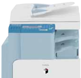
Internal finisher with additional finisher tray