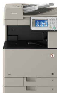
Cassette Feeding Unit-AL1