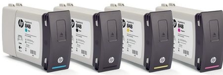
8 HP PageWide XL ink cartridges (2 x 400-ml per color with auto-switch)

The HP PageWide XL 5000 Printer series includes a stationary 40-inch (101.6-cm) printbar that spans the whole printing width. As paper moves under the printbar, the entire page is printed in one pass, enabling very high printing speeds.