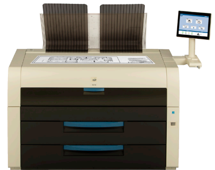
KIP 7970 Print Systems