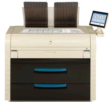
KIP 7570 Print Systems