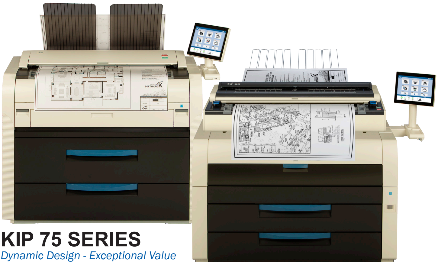
KIP 75 SERIES Dynamic Design - Exceptional Value

New KIP 75/79 Series System Configurations and Specifications