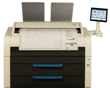
KIP 7980 MFP