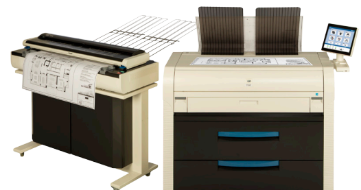
KIP 7590 Production MFP