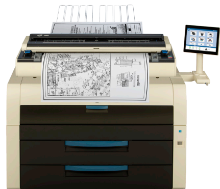
KIP 7990 Production MFP