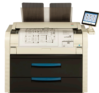
KIP 7580 MFP