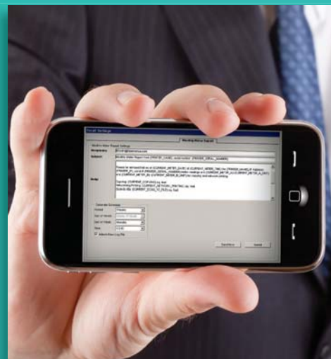
KIP 7100 Automatic E-Systems Reports