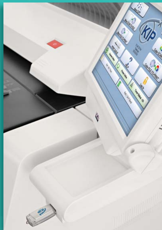
KIP 7100 Integrated USB Port