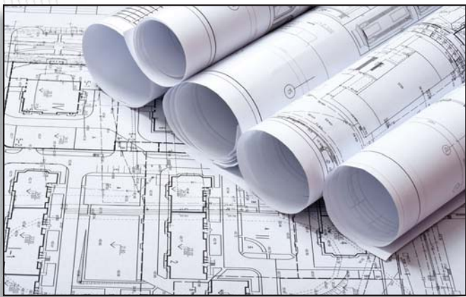
KIP 7100 High Definition Printing

The KIP 7100 delivers fast and accurate copies and prints using toner based imaging technology that produces UV stable prints. 100% toner efficient KIP High Definition Print Technology ensures rich blacks and smooth gradients. Superior 600 x 600 dpi print, copy and scan resolution captures fine details with remarkable tone clarity, keeping reproductions true to the original.