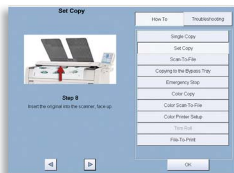
KIP 7100 On Screen Operator Guides

KIP 7100 system operation is simplified with direct access by the operator to the touchscreen system & operator guides. Remote access to the guides is achieved via KIP PrintNET web solutions.