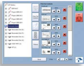
Create Print Sets from the Central Touchscreen