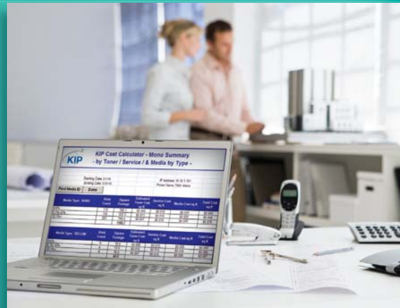
KIP 7100 Integrated Cost Reporting

KIP 7100 additional features can be easily implemented via keycode entry at the touchscreen as required.