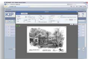
Web Based Viewing & Printing