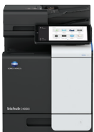
bizhub i-Series C4050i