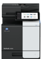
bizhub i-Series C4050i

To learn more, please visit workplacehub.konicaminolta.com