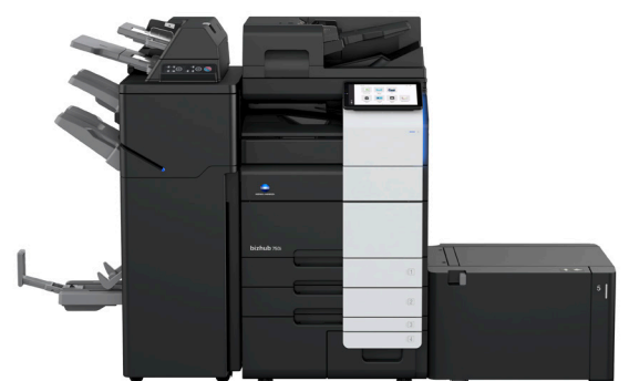
bizhub i-Series 750i