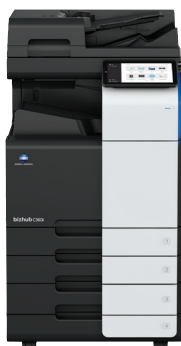
bizhub i-Series C360i