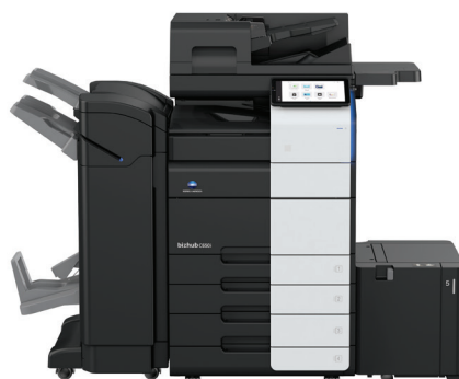
bizhub i-Series C650i