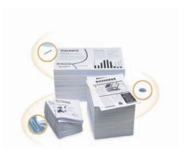
The Aficio<sup>™</sup>MP 9000's range of online finishing capabilities handle punching, stapling, folding, saddle stitching and booklet making.