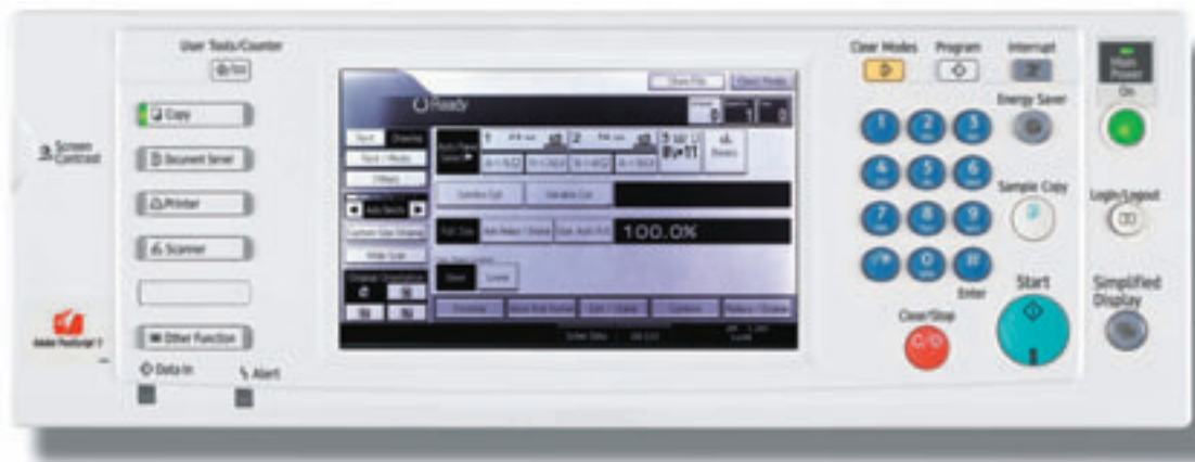
The large, backlit, easy-to-read control panel puts extensive capabilities at your fingertips.

Saving space is great. Saving time is even better. Improve turnaround time when you output documents at a quick 4 or 6 D-size prints-per-minute—a mere fraction of the time it would take a traditional wide format ink jet plotter or analog copier to produce a single document.