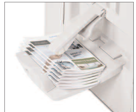
Use the Saddle-Stitch Finisher to create saddle-stitched booklets for handouts, educational and training materials and many other applications.