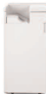
FD5000 Multi-Folding Unit