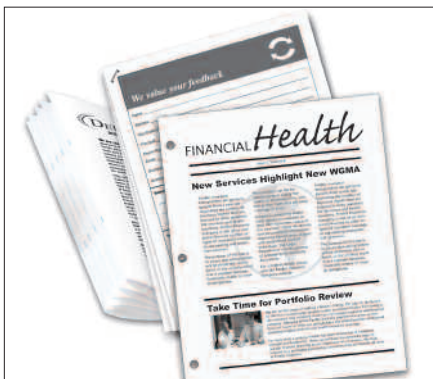
The Savin 9090 series enables you to produce more finished documents in-house and reduce outsourcing costs.