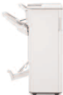
SR4040 2,000-Sheet Saddle-Stitch Finisher with 50-Sheet Stapler