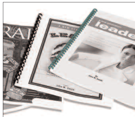
The GBC StreamPunch III delivers cleanly punched documents in several styles.