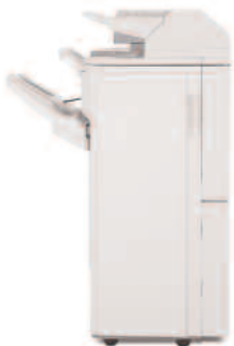
SR4030 3,000-Sheet Finisher with 50-Sheet Stapler and Cover Interposer Tray Type 3260

Create a configuration that delivers the options your customers need. Choose from 3 different types of optional finishers and a Cover Interposer.