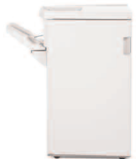
SR4050 3,000-Sheet Finisher with 100-Sheet Stapler