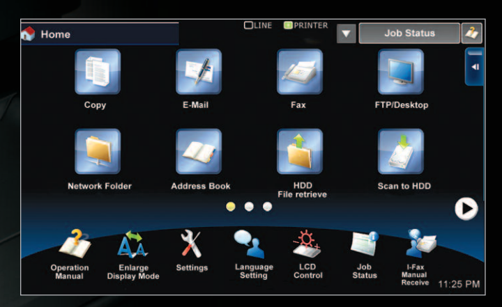
Change the Theme: Easily change the menu colors and Icon layout to suit the preferences of users in your office.