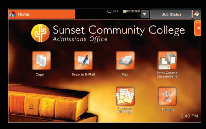
For a College Campus Office: Set up a simple screen for walk-up users to retrieve applications and course offerings.