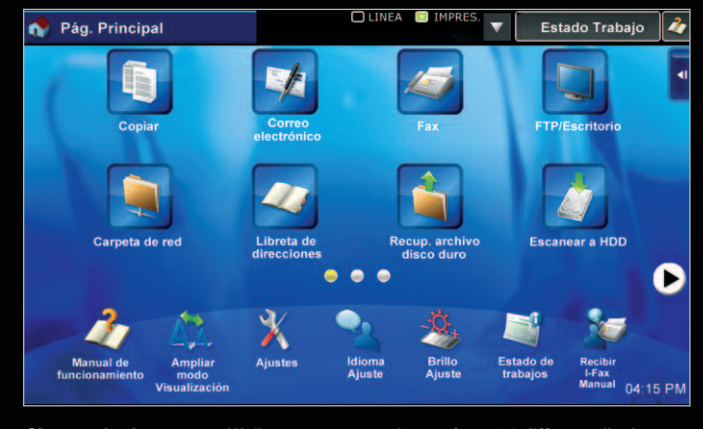
Change the Language: Walk-up users can choose from 24 different display languages with just a few key strokes.