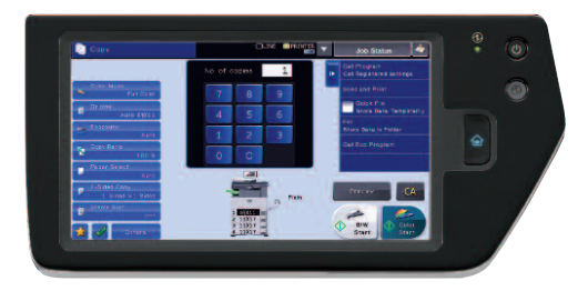
Intuitive copy screen shows options on the left and menu quidance on the right.