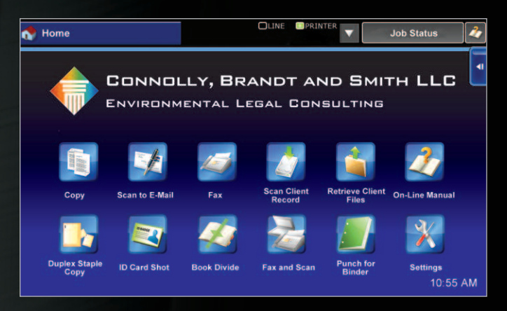
For Legal Environments: Set up custom keys for client files and other frequently used functions.