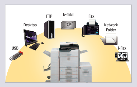
Sharp's integrated network scanning offers one-touch document distribution to up to seven destinations.