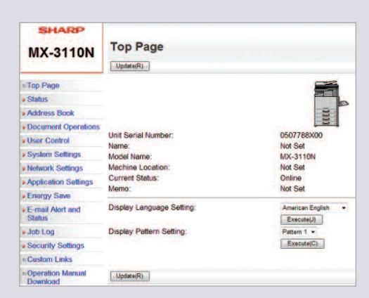
Embedded Web Page.