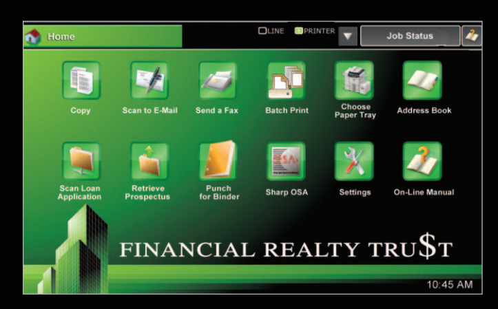
For Financial Environments: Store and retrieve monthly financial reports, scan loan applications and more.