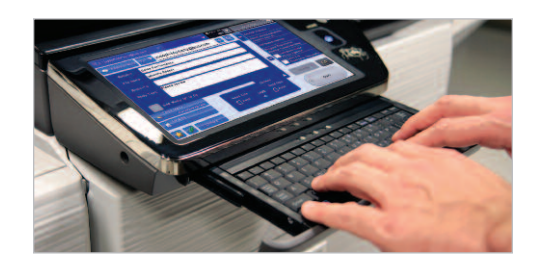
Full-size retractable keyboard simplifies data entry.