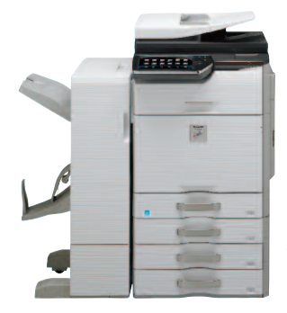
MX-3610N shown with saddle-stitch finisher.

The MX series offers a choice of two high-performance finishers that can give your documents a professional look and feel. Choose from a compact inner finisher or floor-standing saddle-stitch finisher . Both finishers offer three-position stapling and an available 3-hole punch.