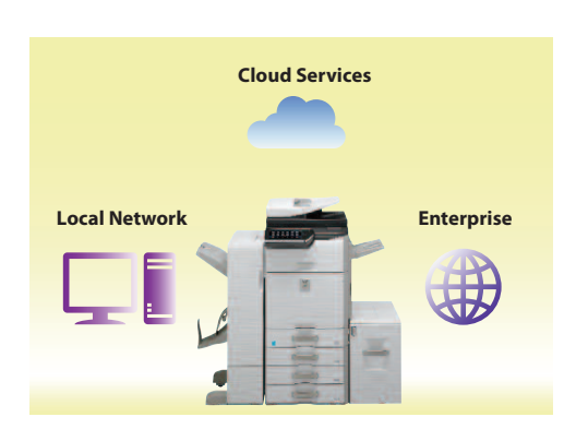
Sharp OSA Technology allows businesses to leverage the power of their network applications, back-end systems, even cloud-enabled services