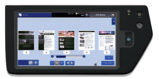
Easily edit documents in scan preview mode.