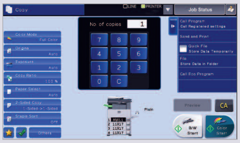
Remote Front Panel