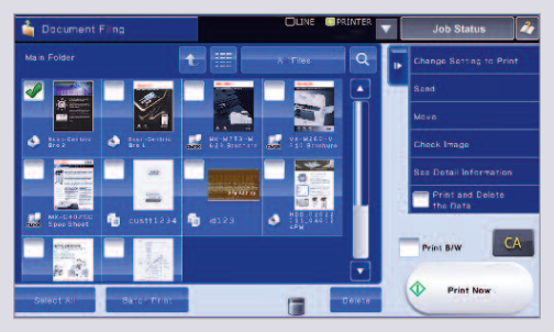
Sharp's document filing system with thumbnail preview makes it easy to locate and retrieve stored jobs.