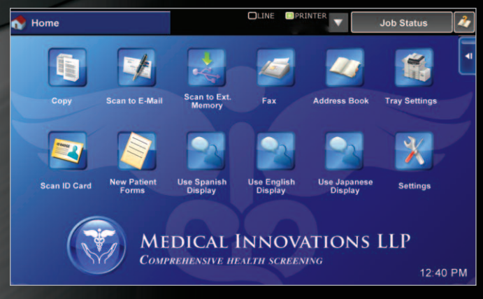
For Medical Environments: Set up custom keys to store and retrieve insurance information, prescriptions and more.