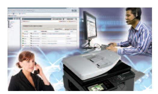
Sharp Remote Device Management