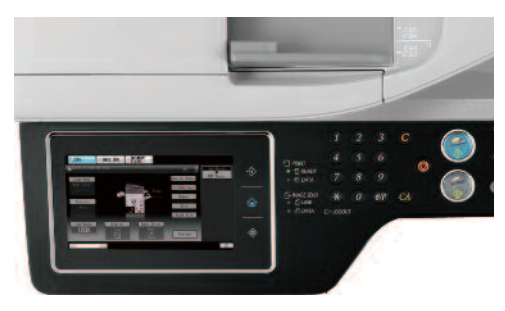
High-resolution touch screen with Stylus pen for easy point-and-touch operation