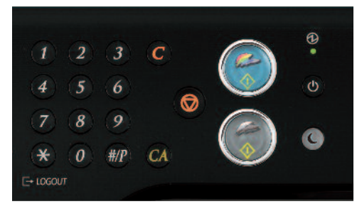
Separate print buttons for B&W and Color allow users to selectively manage use of color