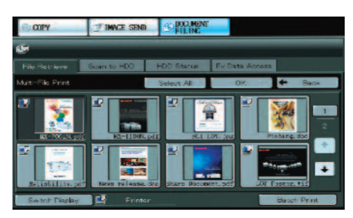
Sharp's easy-to-use Document Filing System with thumbnail preview