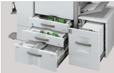
Up to 6,600-sheet paper capacity with available options.