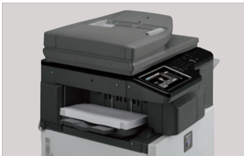
Available compact inner finisher with 50-sheet staple capacity.

A full-featured MFP that is also a strong value – the MX-M364N/M464N/M564N Essentials Series monochrome document systems will exceed your expectations.