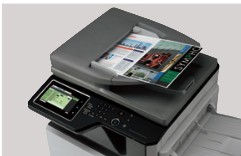
Standard 100-sheet RSPF scans up to 56 images-per-minute.