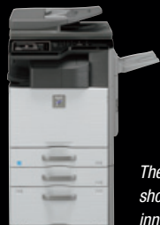
The MX-M564N shown with compact inner finisher.

On-board Document Storage Sharp's easy-to-use document filing system enables users to store frequently used files.