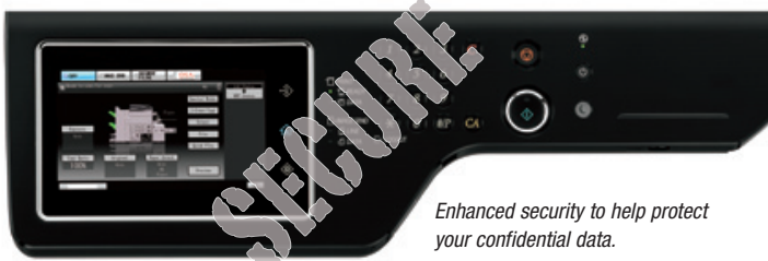
Enhanced security to help protect your confidential data.

The MX-M364N/464N/564N Essentials Series offers several layers of standard security to protect your business and user information . Standard features include data encryption, data overwrite protection, confidential printing and more. And, with Sharp's convenient End-of-Lease feature , all job data and user data can be easily erased at time of trade in.