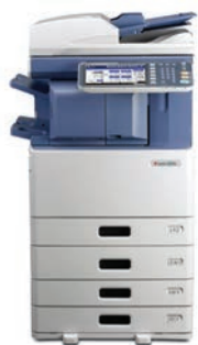
e-STUDIO2550c with Inner Finisher.