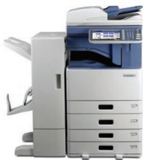
e-STUDIO2550c with Saddle-Stitch Finisher.

maintenance. Instead of overhauling the entire machine, certain features can be restored with the replacement of a single component. The use of tandem printing with another e-STUDIO on the network reduces print time. And if a job is temporarily halted, job skip allows others to print around it.