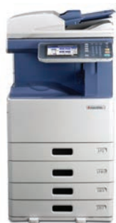
e-STUDIO2050c with Paper Feed Pedestal.