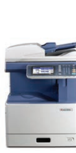
e-STUDIO2050c Base Model