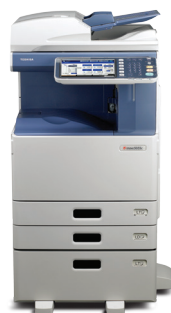
e-STUDIO5055c with Large Capacity Feeder.