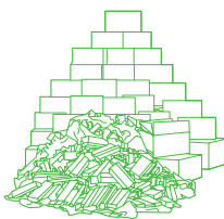
Laser 334 lbs/151 kg

Total waste produced from printing 12,500 pages per month for 4 years.