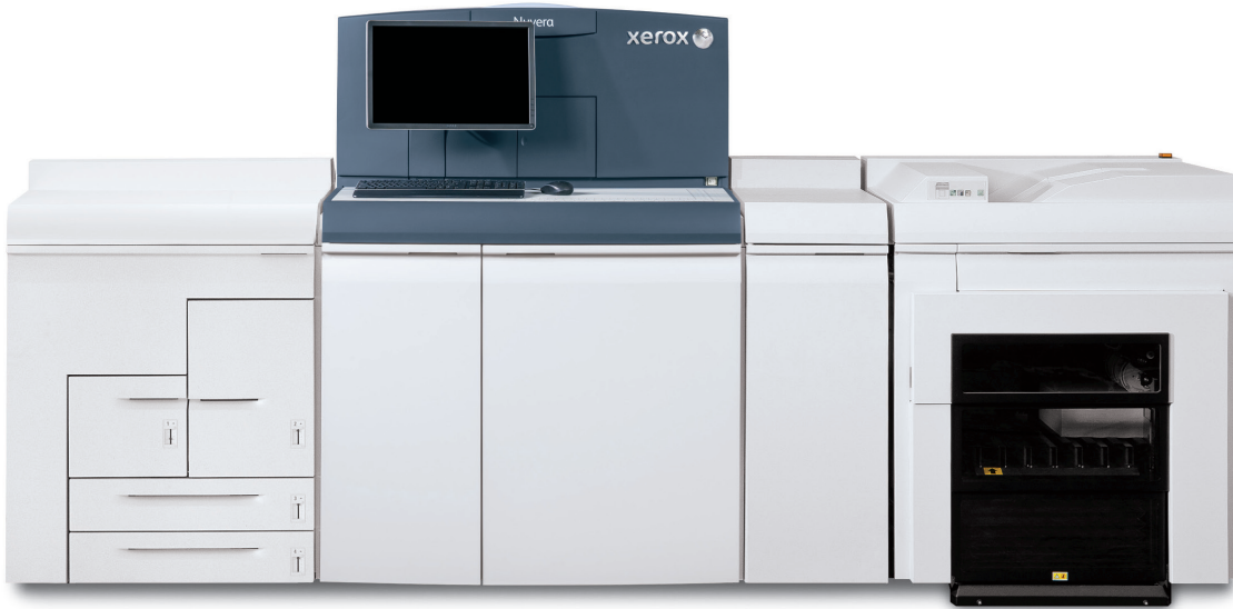
Xerox Nuvera® 157 EA Production System with Xerox® Production Stacker