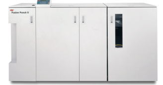
GBC FusionPunch II with Offset Stacker