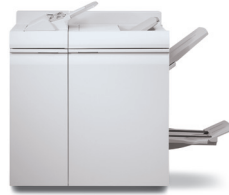
Multifunction Finisher Pro Plus