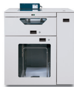
C.P. Bourg BSFx Dual Mode Sheet Feeder