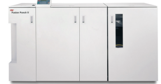
GBC FusionPunch II with Offset Stacker