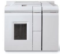
Basic Finisher Module – Direct Connect