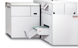
Watkiss PowerSquare 200