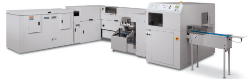
Xerox® Book Factory