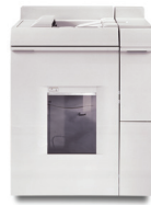
Basic Finisher Module