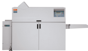
C.P. Bourg BDFNx Booklet Maker with Square Edge