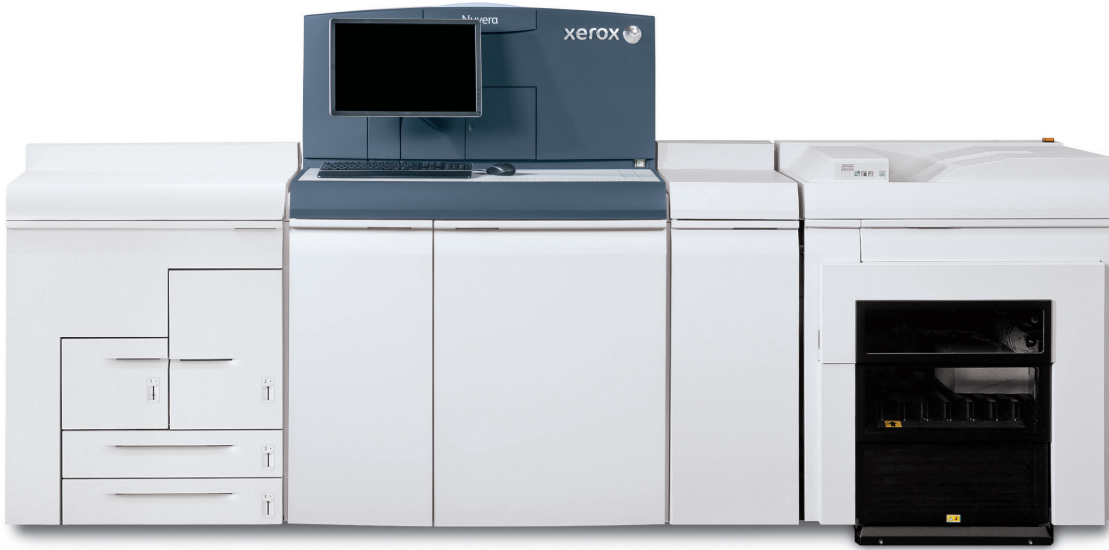
Xerox Nuvera® 157 EA Production System with Xerox® Production Stacker