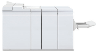
Plockmatic Pro 30/50 Booklet Maker (Available on 100/120/144/157 only)