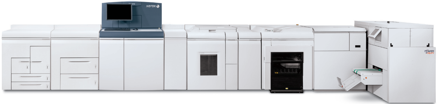
Xerox Nuvera® 157 EA Production System with Xerox® Production Stacker and Watkiss PowerSquare 200