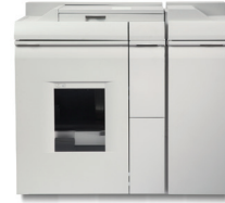
Basic Finisher Module Plus