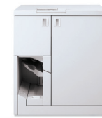
Xerox® Tape Binder