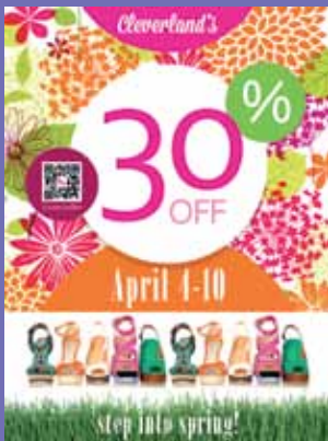
Point of Sale

Producing large quantities of wide format jobs used to be a trade-off , requiring multiple printers and multiple days to fulfill even a single customer request. It's no wonder that these jobs have sometimes been viewed as a problem. But with the Xerox Wide Format IJP 2000, they are a profit opportunity.