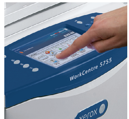
Personalized solutions you access right from the touch screen interface.

ScanFlowStore software by Nuance® greatly reduces document processing time with its powerful Optical Character Recognition technology. Using template-based scanning, a user simply selects specific "zones" on a document from which data specific to industries such as healthcare, legal or financial, is captured and used for file naming, creating network folders, populating PDF properties, searching and retrieving, and routing scanned documents to their correct repositories.